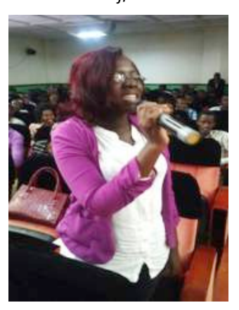
A student during one of the workshop activities

In addition, the gender workshop had sessions where four group discussions were formed to look at applications of mathematics. The groups were: bio-mathematics, mathematics in the social sciences, pure and good mathematics, and financial mathematics. The two-day workshop ended with presentations from the four groups who managed to come up with ideas for five projects.